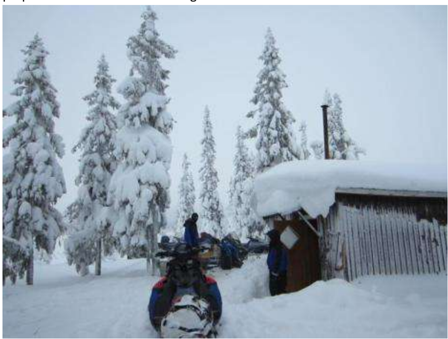
Björn also showed us some tricks how to make fire.

We had to move on at 6.30pm. This was the longest trip. It was hard to see anything cause the snow was really heavy. After a few hours we took a break at the hut where we were 3 days before. We prepared and ate the fish we caught.