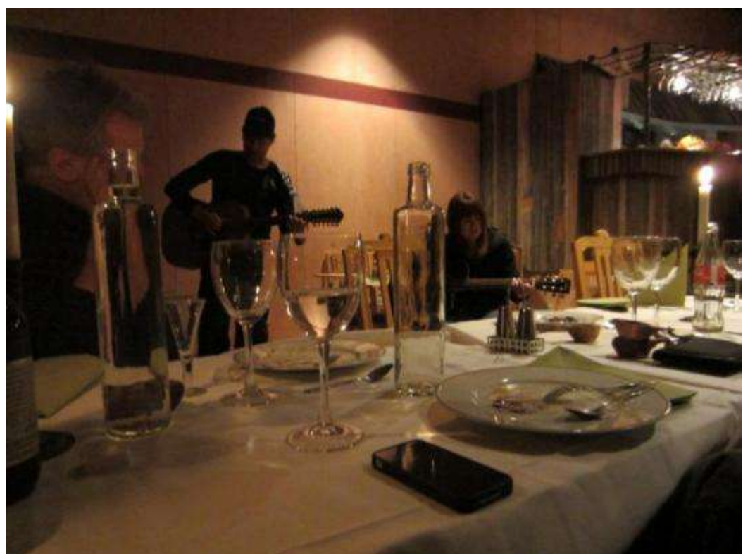
After the show we drank some beer together and the last of us went to bed at 11pm.