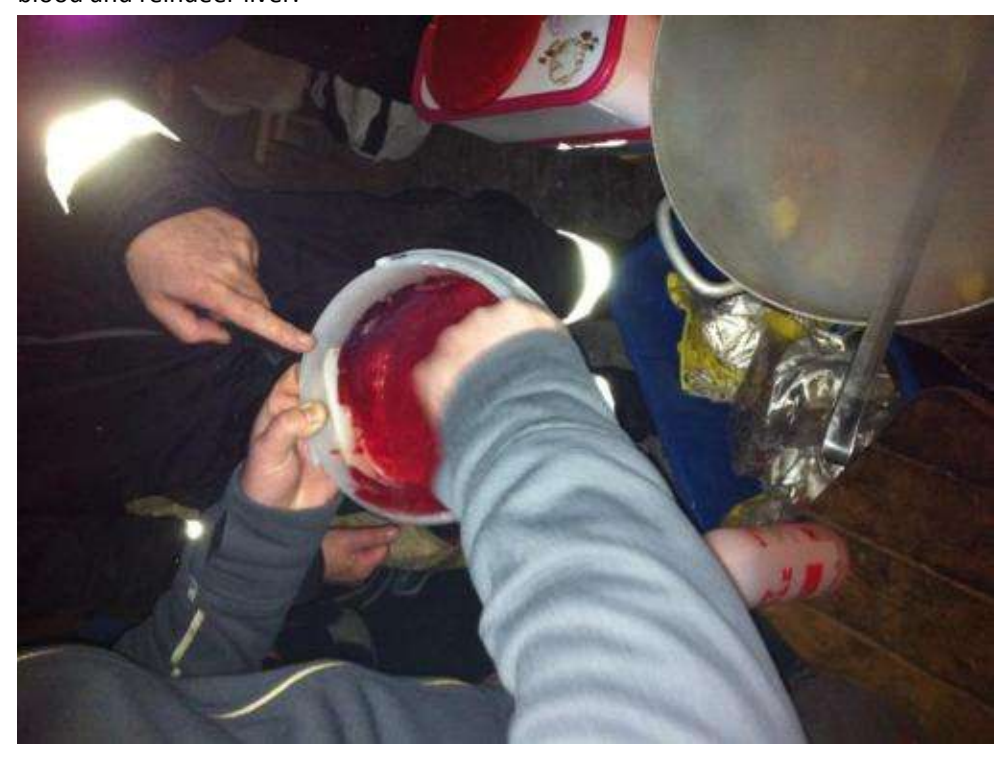
But in the end, It tasted very good which was really surprising.

To be honest, the meal was very scary first. We made soup including reindeer tongue , reindeer blood and reindeer liver.