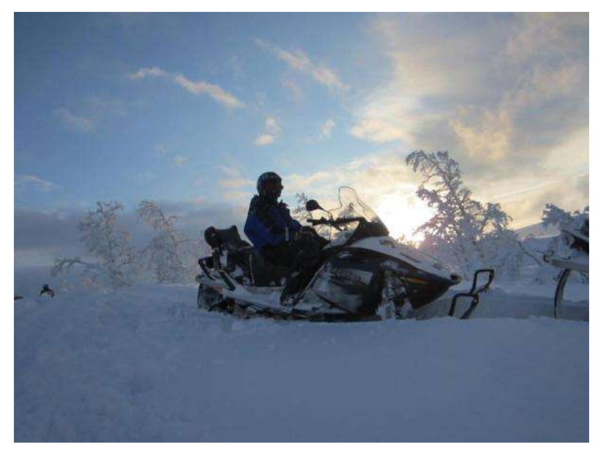
The landscape was really nice. If we looked closely, we could see the snow gliding over the ground.

The next day we woke up 7pm. Our guides brought eggs bread and bacon. We ate a lot and after cleaning up the hut we started driving again. It took us 5 hours to get to Saxn . Driving was really fantastic. There also were some hard parts were we had to drive slowly and carefully.