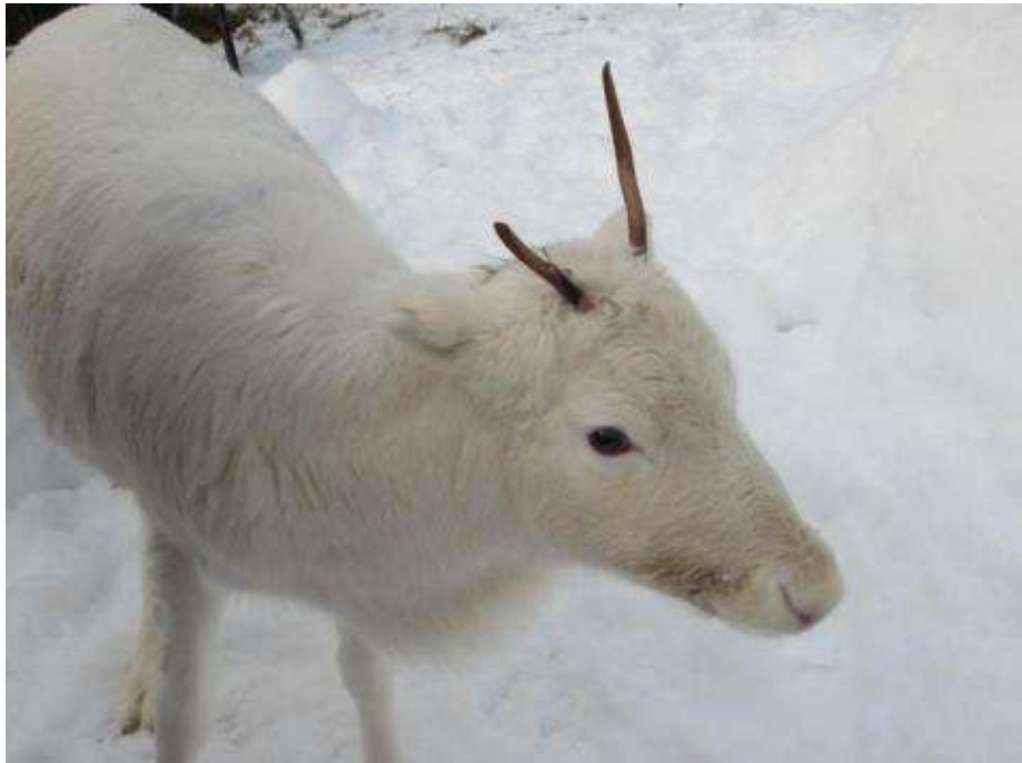
They explained us how they live and how to feed them etc.

I wish I could take on of them home. These are really beautiful animals.